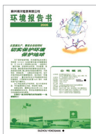
Cover Page of the Environmental Report Published by Suzhou Yokogawa Meter Company