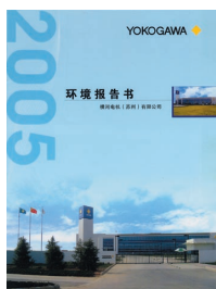
Cover Page of the Environmental Report Published by Yokogawa Electric China Co., Ltd.

Web sites for our environmental conservation activities: http://www.yokogawa.co.jp/eco/toppage-jp.htm (Japanese) http://www.yokogawa.com/eco/eco-toppage-en.htm (English) http://www.yokogawa.com/jp-ymg/corp/eco/eco-info.htm (Japanese)