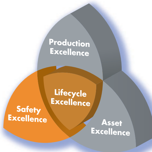
Safety excellence suite

With EJX, you no longer have to sacrifice plant availability for plant safety. EJX allows you to maximize your plant's safe-availability while optimizing operational uptime.