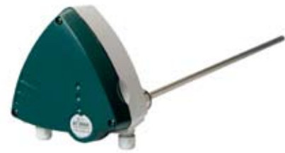
DT450G Dust Monitor