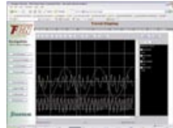
Fig.3 Flow trend on Web browser

The compensated flow and temperature trends can be monitored on a Web browser at a remote site by accessing the controller's URL. Logging settings and report files configurations can be set on a Web browser as well.