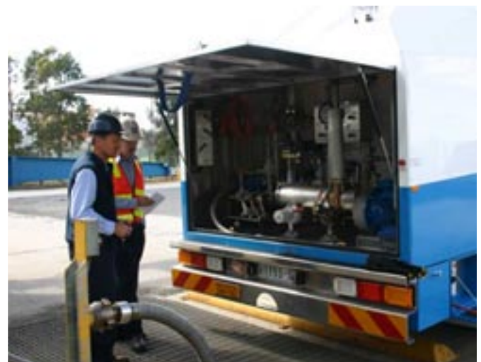
Fig.4 Automatic custody transfer system in truck