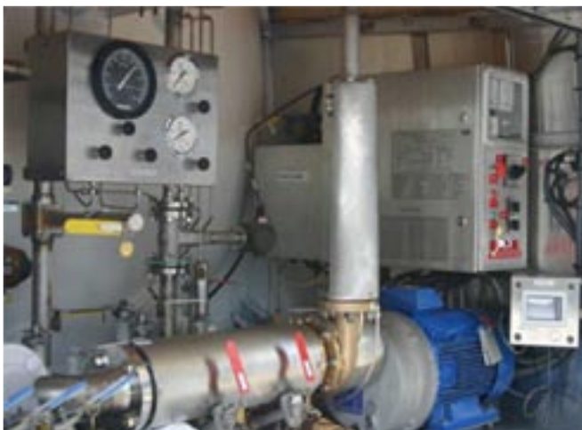
Fig.1 Automatic custody transfer system on a cryogenic gas delivery truck