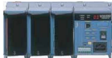
The MW100: Few-channel, high-distributed, networked data logger