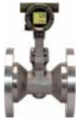
Reduced Bore Type Vortex Flowmeter

To meet the customers' needs, Yokogawa provides the reduced bore type of vortex flowmeter that features welded reducers on both sides of the detector. This expands the range of measurements that can be performed in low-flow conditions, which is normally difficult for vortex flowmeters, and ensures stable and accurate flowrate output.