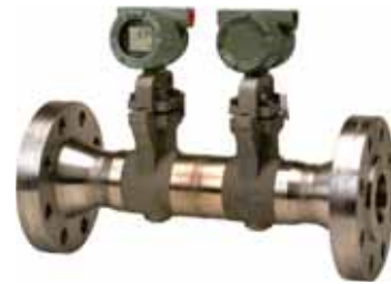
Dual Sensor Vortex Flowmeter

In addition to the external regulations, the customer had a very stringent safety policy in place for a number of critical applications which demanded full redundancy in both process and alarm signals. Yokogawa experts designed special dual sensor type vortex flowmeters that ensured the required redundancy at the very points of measurement.