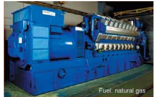
18V34SG Gas Engine of Wärstilä Corporation