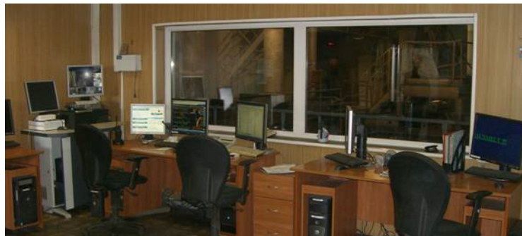
Central control room of Russian Copper Company