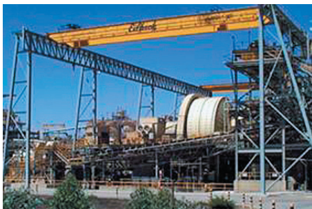
Fimiston Plant (crushing, grinding, floatation, gold recovery, carbon leaching)

The Fimiston Plant long relied on a CENTUM CS distributed control system (DCS), and experienced no major failures while it was in use. In 2009, KCGM decided to replace this legacy system with Yokogawa's latest DCS, CENTUM VP. Yokogawa Australia successfully installed this new system and it has operated with no major problems since the completion of this project in late 2009.