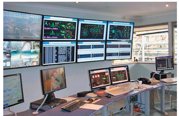
After: CENTUM VP