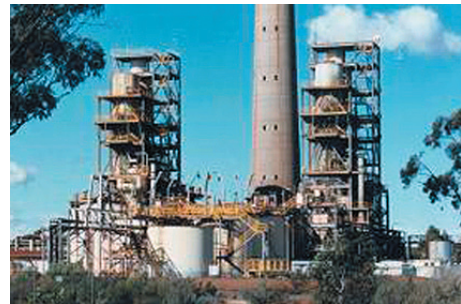
Gidji Plant (roasting, carbon leaching)