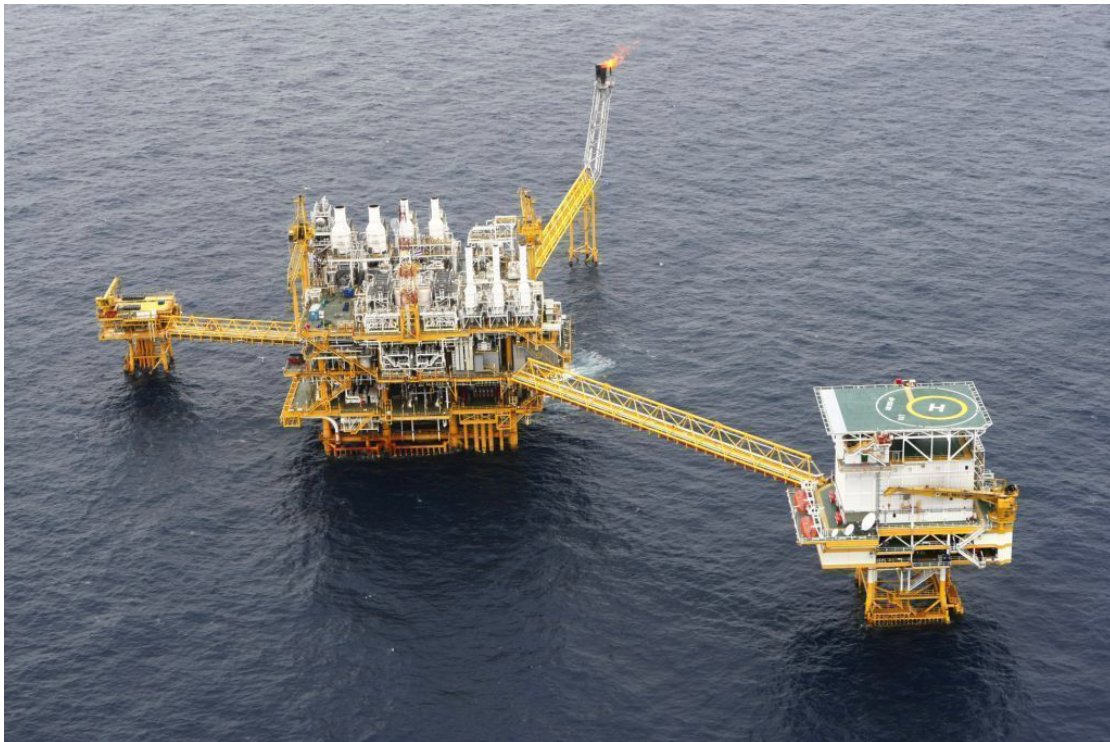
The Arthit Central Processing Platform

Thanks to Yokogawa's highly reliable systems and products, a safe working environment has been achieved for the 120 operators, engineers, maintenance staff, and other personnel stationed on this platform.