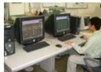
Fig.5 Operation and Monitoring at site

With the Web-based SCADA, there is no need for additional software to perform remote operations. During the test-run phase, as necessary modifications and adjustments are made to an application on site, it is possible to monitor them on site away from the central monitoring, greatly improving engineering efficiency.