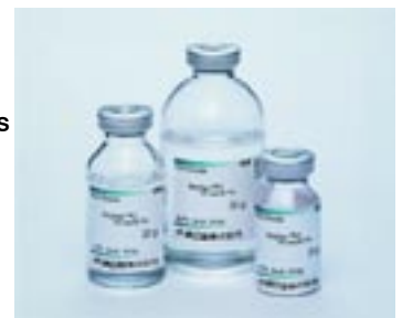
Fig. 1 Water- 18 O

Recently, Taiyo Nippon Sanso became the world's first company to develop a cryogenic oxygen distillation technique for producing the Water- 18 O isotope used in the FDG-PET method to diagnose cancer. The company's long experience with cryogenic air separation plants was a key asset in this undertaking.