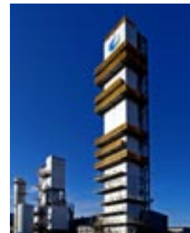
Fig.2 Installation Site

Cryogenic air separation plants produce condensed pure gasses such as nitrogen, oxygen, and argon for use in a wide variety of industries manufacturing metals, semiconductors, and other materials. To ensure stable supply, mid-sized air separation plants are often built next to the major industrial plants that uses these gases. With its dual-redundant CPUs, networks, and power supplies, STARDOM's highly reliable FCN controller ensures the stable gas supply to the main plants, so that these manufacturing operations can continue without interruption.