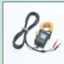
96001 Clamp probe*