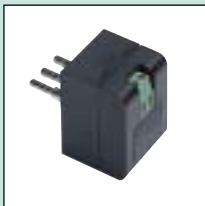
788041 Temperature input adapter