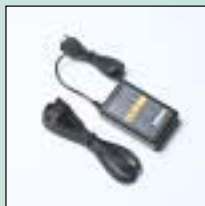
788011 AC adapter