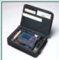
788081 Carrying case