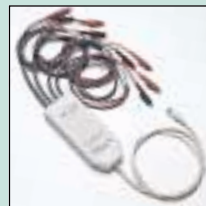
788035 Logic probe (±250Vrms)