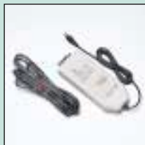
788025 DC-DC converter