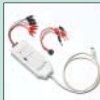
788031 Logic probe (±35VDC)