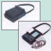
788082 Small case