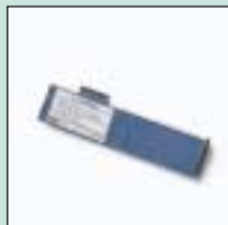
788021 Rechargeable battery pack