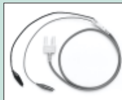
366963 Measurement lead