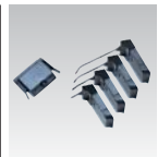
Disposable felt-pen, Plotter pen