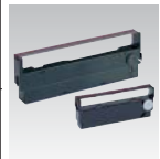
6 color ribbon cassette