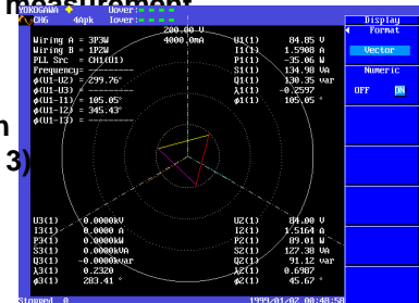
Example of vector display between 3 phases