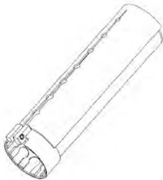
M1234SE-A self cleaning - fly ash filter Specifications: