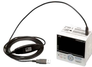
Configuration via Bus-powered USB Cable