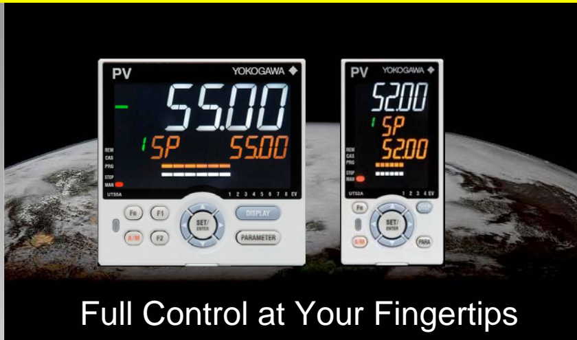
Full Control at Your Fingertips