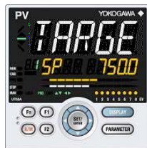
Scrolling Text, Multi-Lingual