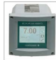
Type: 4 wire type