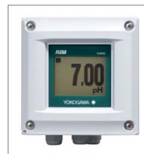
Type: 2 wire type